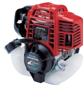
GX25 / HHT25

Designed to handle various applications, Honda offers two different models of the Mini 4-stroke engine: the 25 cc and 35 cc. Choose the one that best fits the job at hand.