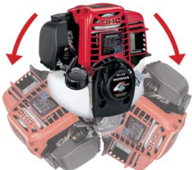
GX35 / HHT35

All Honda string trimmers have the advantage of 360° inclinable 4-stroke engines, which means they can be used and rotated in any position.